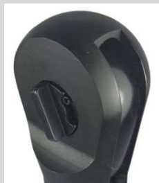
Sealed head ( for durability )