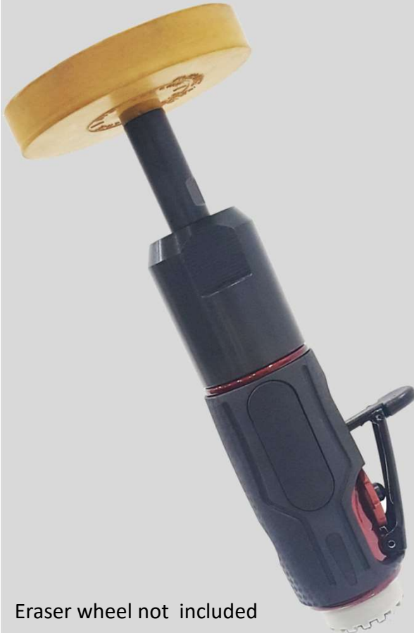
Eraser wheel not included